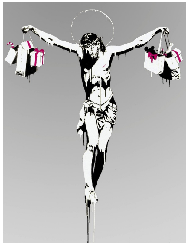
Figure 3. "Jesus Christ with shopping bags" showing the figure of Jesus Christ carrying shopping bags, illustrating the reality of consumerism in Christmas celebrations.

(1) The use of popular cultural icons are combined with certain symbols related to the