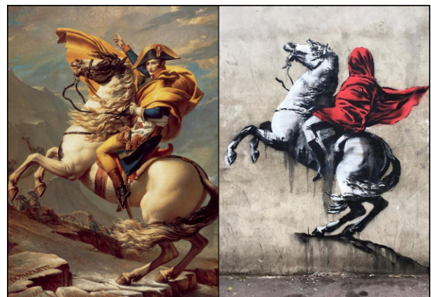
Figure 1. Banksy's parody on Napoleon's painting, a form of resistance against esthetic domination as well as strategic efforts to depict reality.

(2) The approach used by Banksy is basically a strategic effort to get a stronger impression on his works. Realities that are actually chaotic must be displayed in a chaotic manner to make it easier for the appreciator to interpret the work. Essentially, Banksy invites the public to be honest in seeing reality. In addition, contemporary paradigms have encouraged Banksy to use this strategy.