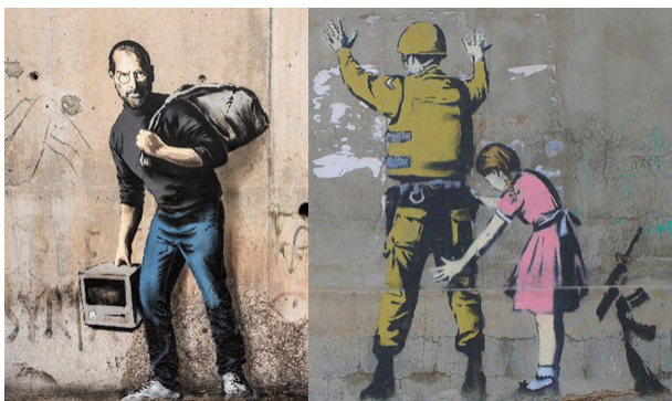
Figure 2. Steve Jobs, founder of Apple (left). A soldier and a child (right). The use of certain figures are intended to reinforce certain messages.

(3) Banksy's visual works are sometimes very simple with one or two displayed figures; therefore, not too many symbols are displayed, which is different from most mainstream art works.