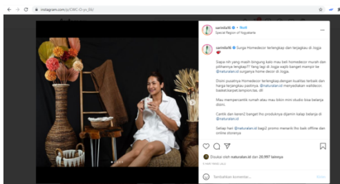
Figure 2. Endorsement Selebgram