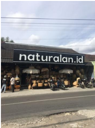
Figure 1. Store Naturalan.id

Naturalan.id targets the middle and upper class of the market. This is because the price given by Naturalan.id is relatively expensive. After all, they prioritize quality over product quantity. Naturalan.id said its products are more targeted at family consumers than students. Therefore, the products offered are usually a set of family home decor.