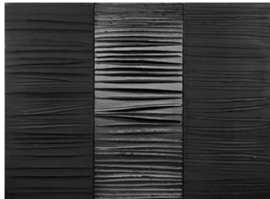
5.diagram Pierre Soulages-Untitled ( https://www.tate.org.uk/art/artworks/nicholson-1934-relief-t02314 )

The flu of geometric abstraction as a phenomenon in the work of Fernando Garcia Ponce is suggestive. Art informel, also known as lyrical abstraction, has a strong influence and meaning. It is easiest to describe with these words: expressive, spontaneous, raw, built from color spots, using unusual and mixed materials. “Abstract gesture painting, but some of its branches have also been called lyrical abstracture, material painting, and Tasmism.” (Dempsey, 2020) I open up a great deal of space for this endeavor, since the composition, the use of color is approached by a deeper intuitive form language. It provides a formal freedom, but it feeds on itself. Through these key elements I build the structure of my works, it does not follow a predetermined system of form. But rather I create intuitive room for manoeuvre, “only expressing its own feelings in a non-figurative form.” (Dempsey, 2020) Key representatives for me are Pierre Soulages, Hans Hartung, Jean Messagier. The gestures, abstract form language and the structure of their line techniques gave me new feelings and sympathy. Pierre Soulages-Untitled; Jean Messagier-The uniformity of the beautiful weather; Hans Hartung-T1965-H31.