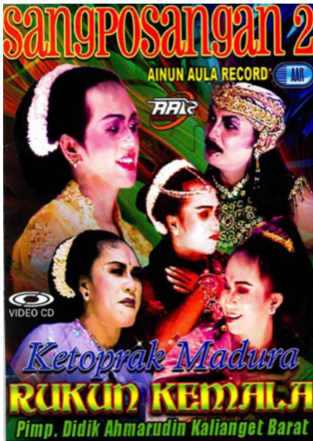
Figure 2: CD cover Sangposangan MTK Rukun Kemala.

Sangposangan also presents kèjhungan which is Madurese song related to the play. Kèjhungan