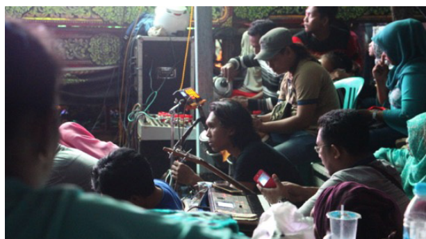
Figure 8: Players of keyboard, bass, kendang dangdut and pad drum.