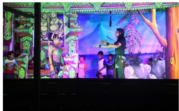
Figure 1: Sangposangan fragment of MTK Rukun Famili.

MTK consists of some parts which are opening music, srimpi/bedaya dance, comedy (similar to Ludruk) and main or play ( ketoprak play which contains sangposangan fragment). In its music, MTK uses music of Madures gamelan by playing