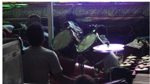
Figure 3: Kendang player at once drum player with other music players playing under the stage.

Music in sangposangan is a kind of possibilities happened in musical scheme, in which two different music which has different perspectives are integrated (collided) but not fused. It is emphasized that in sangposangan music, there are two kinds of instruments (western and Madurese traditional music) played by using different tune standard (see Figure 3). Gamelan instruments group uses pure tune of gamelan as done hereditary in Madurese culture. Gamelan tune in Madura is done by standard of tuner's subjectivity. Gamelan tuner uses standard of senses got from deep spiritual process (inner depth). The Madurese gamelan has salindru (slendro) pitch which is certainly authentic and not always precisely same with salindru (slendro)